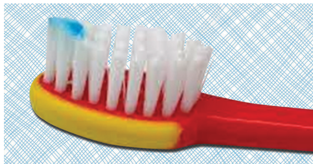
Fig. 1: Using a very small amount of toothpaste.