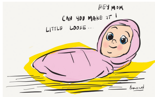
Fig. 3: Swaddling of a baby.