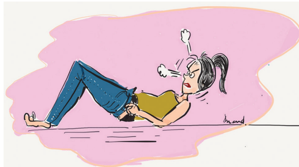
Fig. 5: Side effects of wearing a tight jeans.